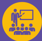
Spacious Class Rooms