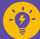
Atal Tinkering Lab