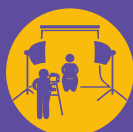
TV Studio / Photography