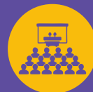
Auditorium & Multi Purpose Hall