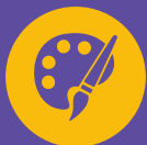
Art & Craft Room