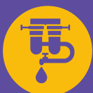
R.O. Drinking Water