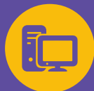
Junior & Senior Computer Labs