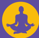
Dance / Yoga Room