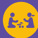
Kreedo Montessori Lab