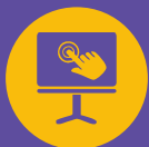
Interactive Flat Boards