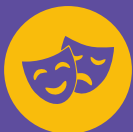
Theatre for Performing Arts