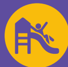
Kids' Indoor Play Area